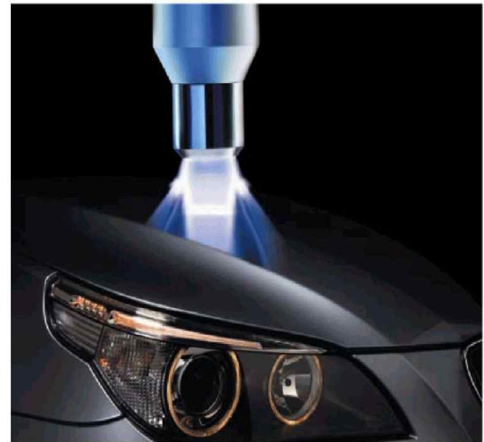
Figure 2 Among the large number of pretreatment methods in industrial processes the use of environmentally friendly and cost-saving methods is steadily growing in importance in automotive engineering. The atmospheric plasma technology Openair® not only provides surfaces with ultrafine cleaning and great improvement of adhesion, but is also often the only way of producing secure joints.